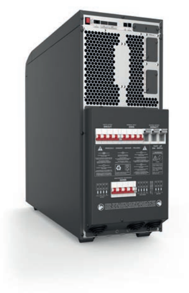
Rear view Sentryum Compact.

Modern guidelines and sustainable best practices direct us to conceive and design UPS with particular focus on the entire product life cycle, therefore applying ultimate but resilient technologies, recyclable materials and miniaturisation